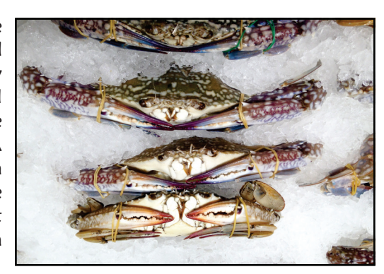
(FSSC CONTINUED ON PG 6)

An additional category of nonconformity has been introduced in the new version-critical non-conformity. A critical nonconformity is issued when food safety is directly impacted during the audit or when legality and/or certification integrity are at stake. When a critical nonconformity is issued at a certified site the certificate will be immediately suspended for a maximum period of six (6) months. A follow-up audit will be conducted by the CB within the six (6) month time frame to verify the closure of the critical nonconformity. The certificate will be withdrawn when the critical nonconformity is not effectively solved within the six (6) month time frame. In case of an initial certification the full certification audit will be repeated.