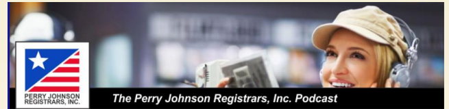
The Perry Johnson Registrars, Inc. Podcast